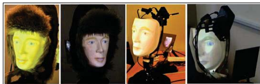
Figure 3. Snapshots of Furhat in close-ups.