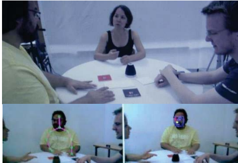
Figure 2. Top: a snapshot of the human-human data collection showing the tutor and the table, containing the colored cards, and the microphone array. Bottom: A view from one of the Kinects showing overlays of the real-time head-pose and torso-skeletal tracking.